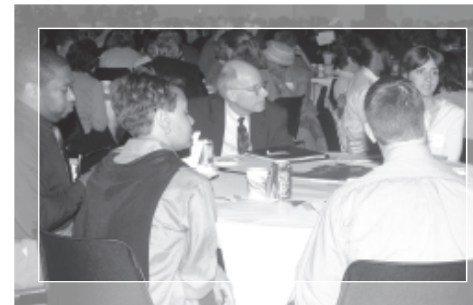
Summit participants brainstorm ways to overcome potential roadblocks to success.